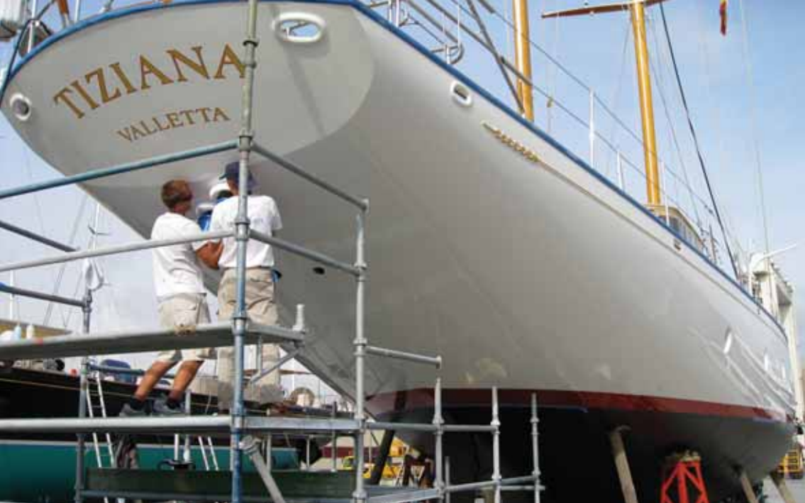
▼ 11kg orbital polishing machines